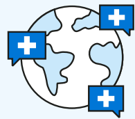
Second Medical Opinion

Our Group income protection and Critical illness cover products are designed to help provide you with financial protection. They are also designed to give you and your immediate family* access to additional healthcare services while you are covered. And you don't need to make a claim on your employer's insurance to use them. These services are provided by our partner, Medigo, at no additional cost. Click the icons below to read about each service: