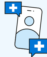
Nurse Support Service