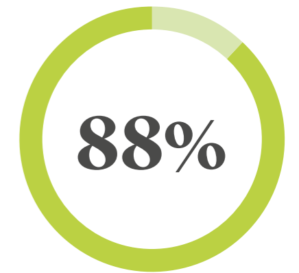
of employees do not feel supported by their employer when it comes to the later life care space*

Staff members affected are usually in the 45-65 age bracket, and at the peak of their working careers. Recognising there could be a big impact upon your wellbeing and your work, your employer has put this support in place. If you found yourself in